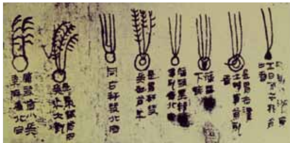
Various forms of comets were depicted in China's Mawangdui Silk Texts, compiled more than two millennia ago. Ancient Chinese astronomers also mapped the stars and documented supernovas.

90 exploding stars in texts between around 1700 B.C. and A.D. 1600. The most famous, perhaps, is a supernova that occurred in 1054, creating what's now called the Crab Nebula. Several Chinese observations of the 1054 supernova exist, including a description in a history of the Song Dynasty that locates the explosion: "A guest star emerged several [inches] south-east of Tianguan. After more than a year it gradually disappeared."